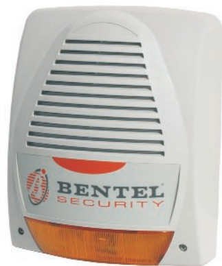
LADY Self-powered siren for outdoor use. Antifoam and strobo versions.