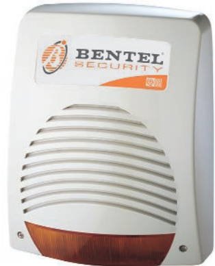
CALL Self-powered siren for outdoor use. Antifoam and strobo versions.