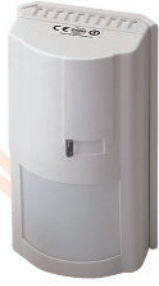
AMD10 Wireless pet-immune PIR detector.