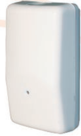
AMC30 Wireless magnetic contact with auxiliary input for rollerblind detector.