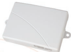
VECTOR/RX8 8 zones wireless receiver.