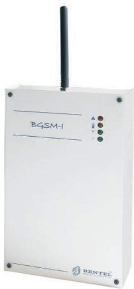
BGSM-G SMS dialler and GSM interface with Contact Id dialler.