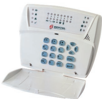
ALISON8L 8 led keypad.