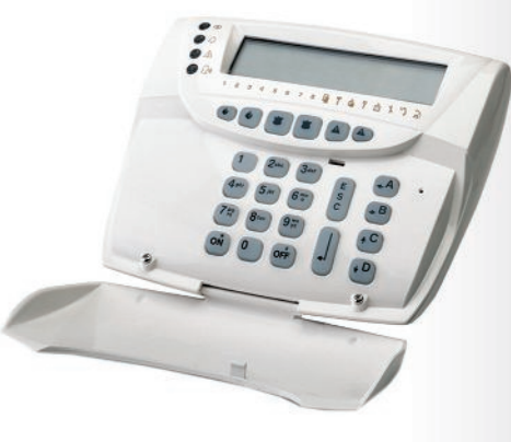
MIA-D MIA-S Two lines LCD keypad.