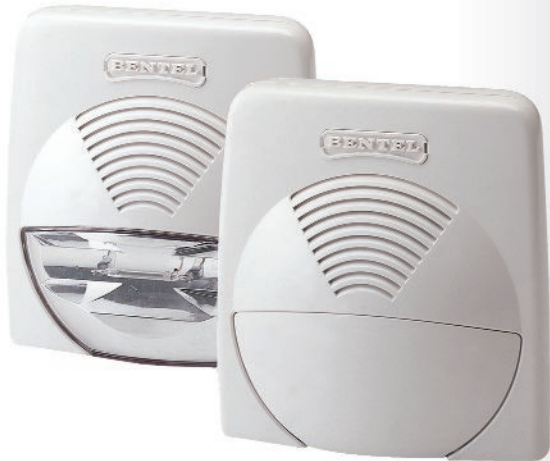
WAVE Siren for indoor use. Self-powered and strobo versions.