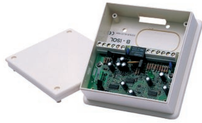
B-ISOL BPI bus isolator.