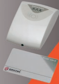
PROXI + PROXI CARD Proximity card reader for indoor/ outdoor use. Proximity card.