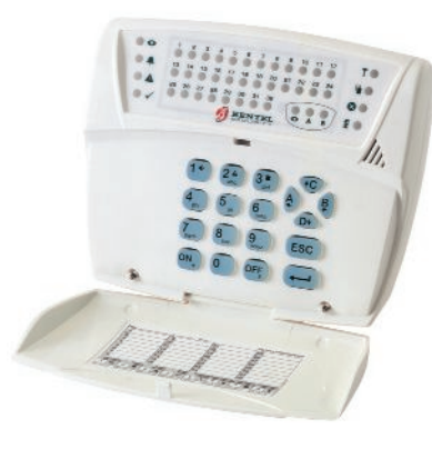
ALISON32LP 32 led keypad. Integrated proximity reader.