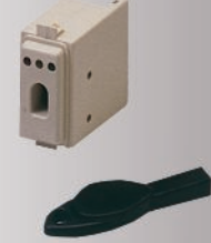
ECLIPSE + SAT Proximity key reader for indoor/ outdoor use. Proximity key.