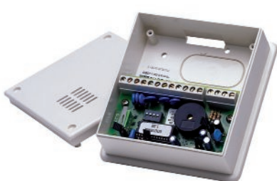
M-OUT/6 Remote 6 output expander module.