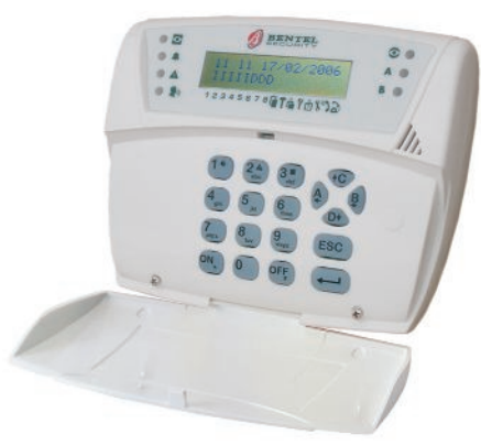
ALISON-S ALISON-DVP Two lines LCD keypad. Integrated proximity reader (vers. DVP)