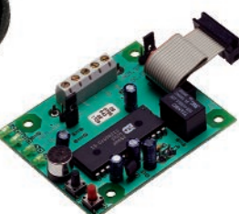
NC2/VOX 8 messages voice board.