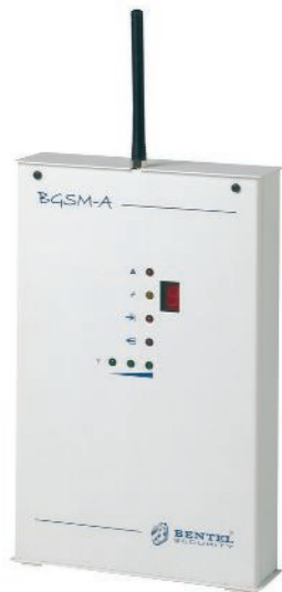
BGSM-A Voice and SMS dialler and GSM interface.