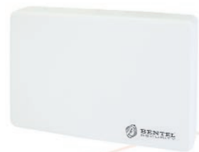
VECTOR/RX 32 zones wireless receiver.