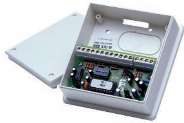
M-IN/6 Remote 6 input expander module.