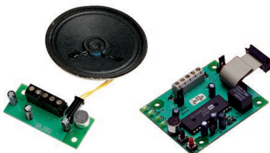
VOX-REM Remote two-ways audio board.