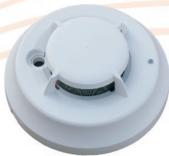
ASD20 Wireless smoke detector.