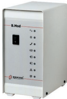
B-MOD High quality modem.